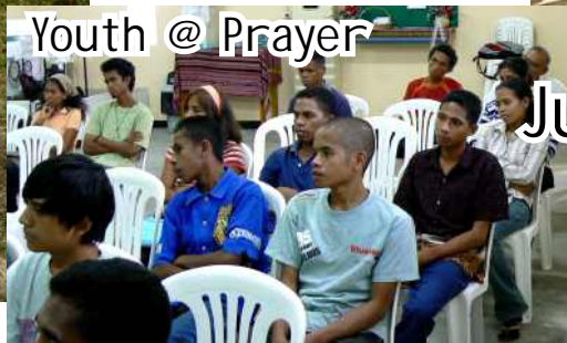
Youth @ Prayer