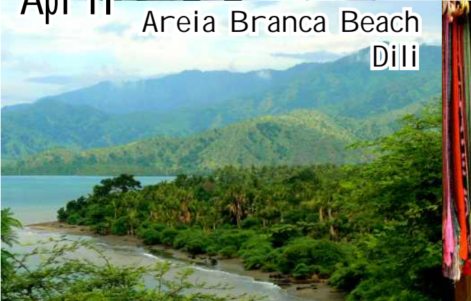
Areia Branca Beach Dili