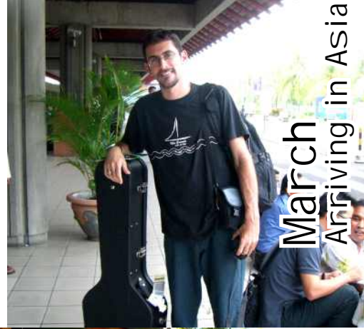
March Arriving in Asia