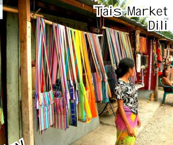
Tais Market Dili